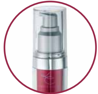
Anti-Aging System 12h-Active-Serum The 12h long term care effect