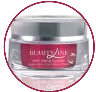
Anti-Aging System Eye Cream - care for radiant eyes